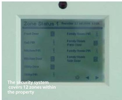
The security system covers 12 zones within the property