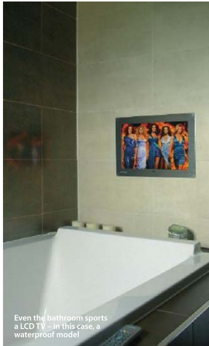
Even the bathroom sports a LCD TV – in this case, a waterproof model

Geoff sees security – as well as lighting and heating – as growth areas in CI. "There's a lot of product out there and we can now take a client's ideas, and not only turn them into something that's easy to use and does what they want it to do, but we can constantly surprise them by doing something that they didn't even know was possible, and at a good price."