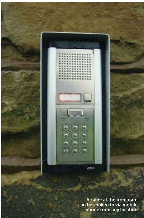
A caller at the front gate can be spoken to via mobile phone from any location